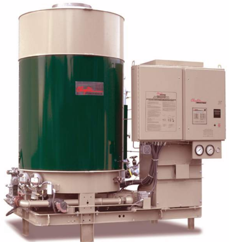
E204 200 BHP Steam Generator